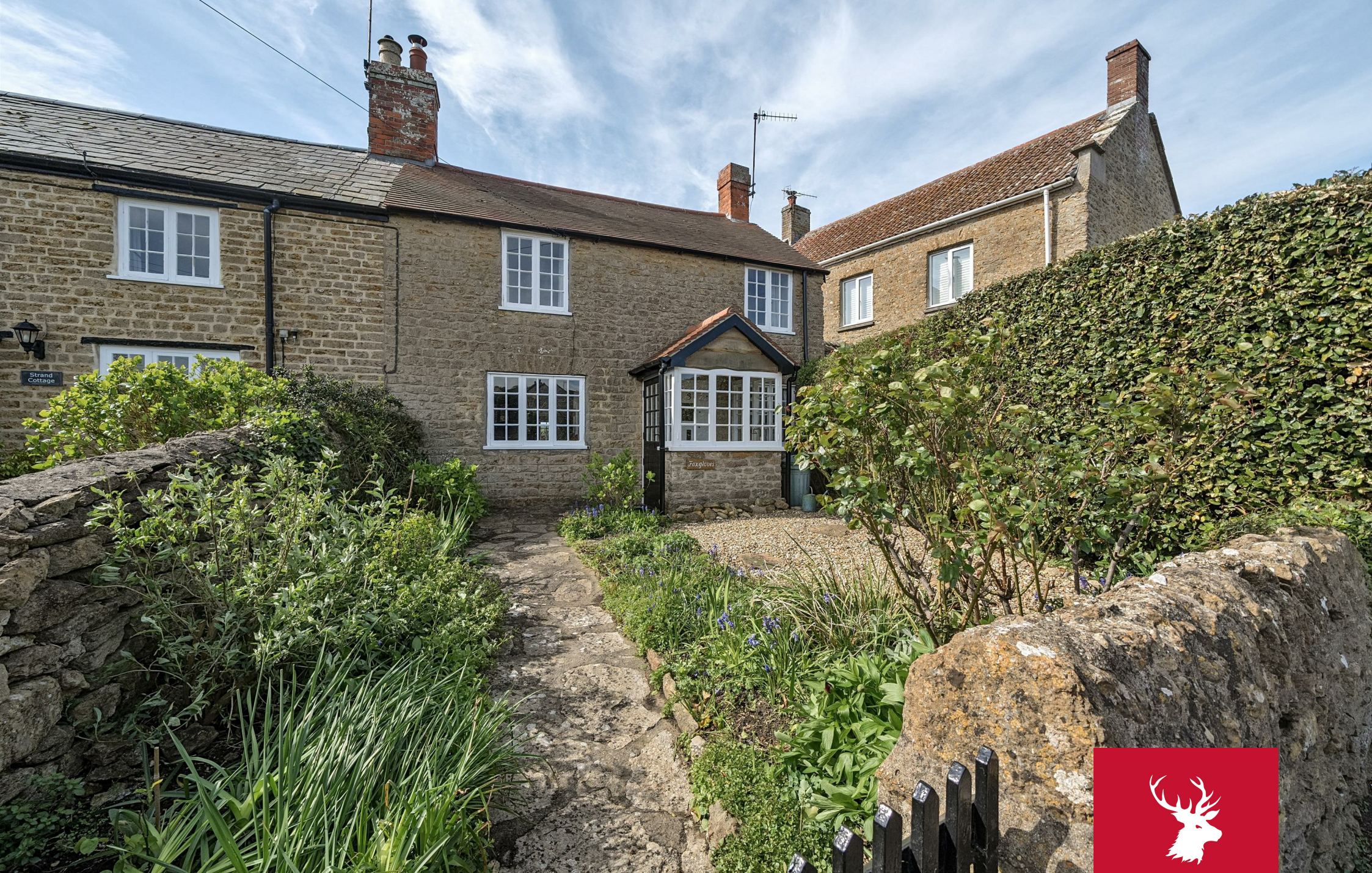
Foxgloves 3 High Street